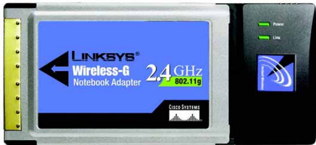
Figure 3-1: Front Panel

The Network Adapter's LEDs display information about network activity.